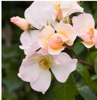
Salvy Holmes is a disease-resistant, low-maintenance climbing rose that blooms throughout the season.

If disease or pest problems can't be managed by good garden housekeeping, you may want to use a less-toxic pesticide. Because these products prevent but do not cure disease, treatments must begin before symptoms are widespread. To avoid burning leaves and flowers with chemical spray, water plants the day before you treat them and test a few leaves and petals before spraying the whole plant. Be sure to coat both sides of the leaves.