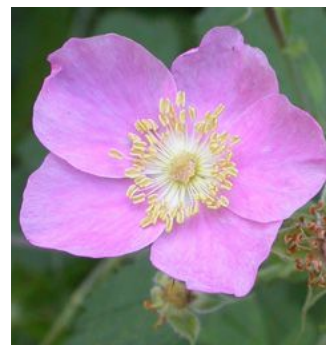
Rose varieties with fewer petals, like the native Rosa californica , grow better in cool summer areas.