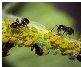
Ants are attracted to the honeydew that aphids make.

Aphids (and other plant pests including whiteflies and scale) produce a sweet, sticky substance called honeydew that attracts ants. Seeing a lot of ants on plant stems is a sure sign of a pest infestation. Since ants will actually protect honeydew-producers from natural predators, it's important to keep ants away when you're trying to get rid of aphids.