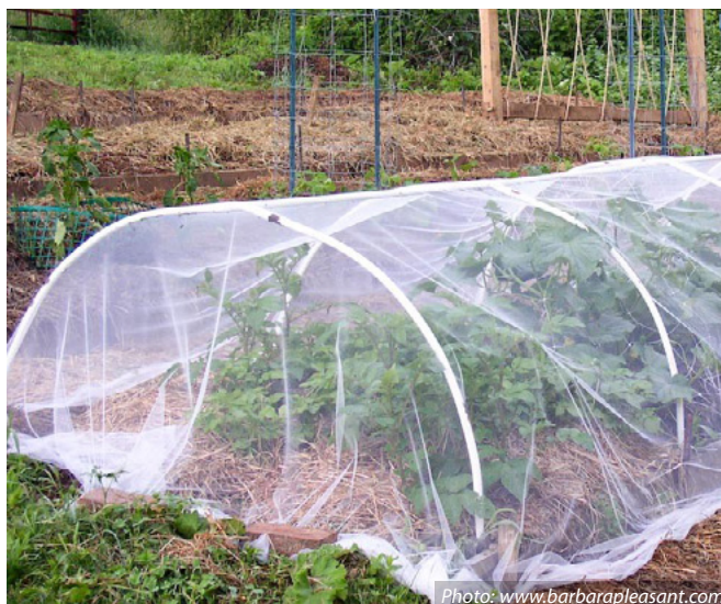
A row cover will keep aphids away from plants.