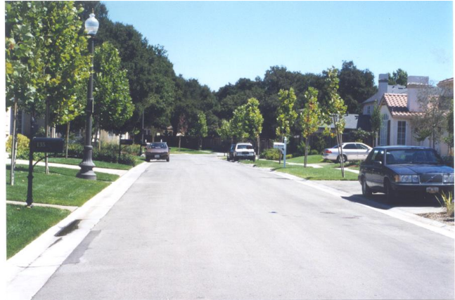
Photo 3-1. Example of a narrow street with parking pull-outs