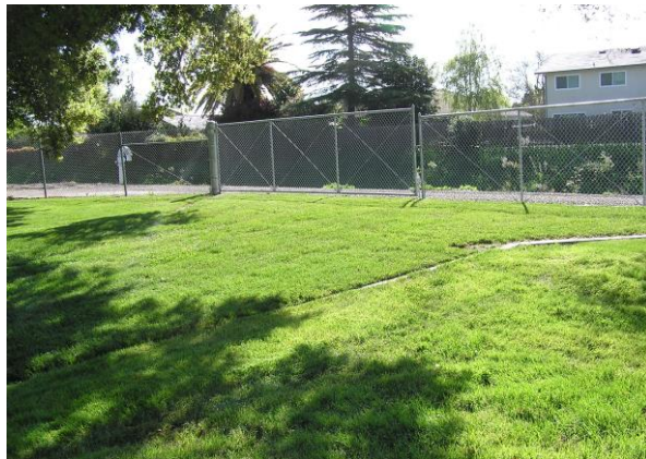
Photo 3-2. Pleasanton Sports Park includes this turf block fire access road.