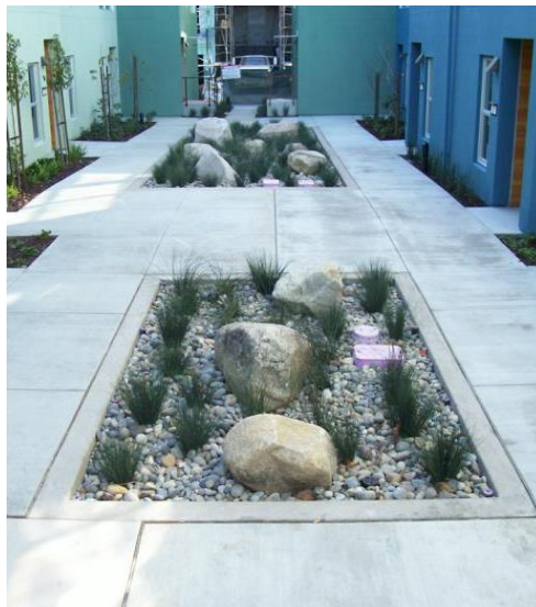
Photo 3-5. Flow-through planters are incorporated into the landscaping in a dense, urban setting in Emeryville.