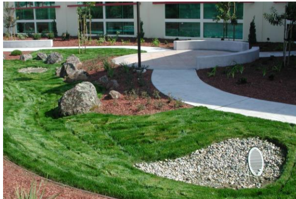
Photo 3-4. Drain rock is used to prevent erosion of this vegetated swale at Zone 7 Water Agency's office building.