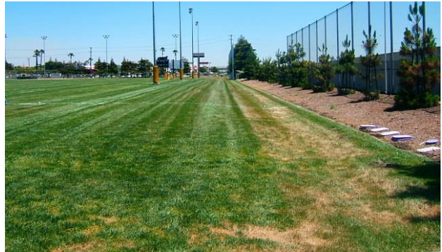
Photo 3-3. This sports field in Dublin also functions as a stormwater detention area.