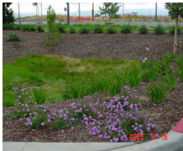
Bioretention area in Fremont

When land is covered with buildings and pavement, runoff enters creeks at higher rates and volumes, resulting in channel erosion and flooding.