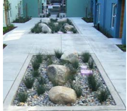
Flow-through planters provide biotreatment of runoff in Emeryville.

Check with the city where your project is located for specific application requirements. See Contact Information, below.