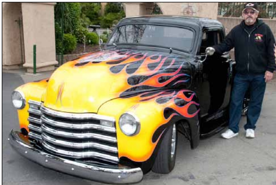
Ken Freitas showed his chopped and flamed 1949 Chevy pickup at the Goodguys All American Get-Together in March.

Today, the tradition of car enthusiasm in the East Bay continues. The classics are on display in Danville at the prestigious Blackhawk collection. Vintage muscle cars and hot rods are offered for sale at Kassabian Motors in Dublin and at Specialty Sales in Pleasanton. In Emeryville, vintage