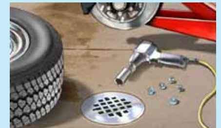
Sanitary Sewer Drain: an indoor drain that flows to the sewage treatment plant.