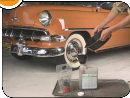
1954 Chevrolet Bel Air

Drain all the oil from the engine and filter into the pan. Drain the filter overnight to capture as much oil as possible. Use a funnel to transfer the oil into a leak-proof container.