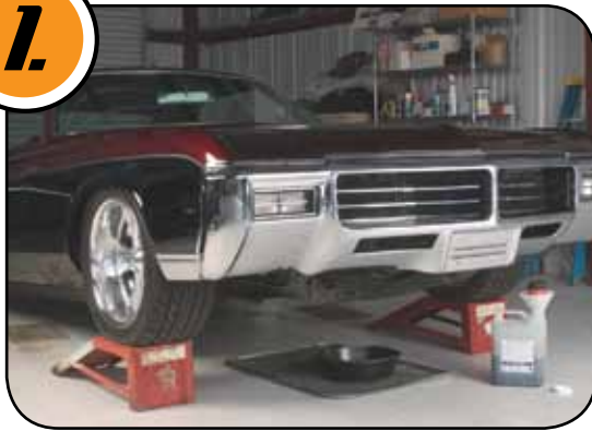
1969 Buick Riviera

Before draining your oil, make sure the drain pan is clean and large enough to capture all the oil. Have rags handy to clean up any drips and spills immediately.