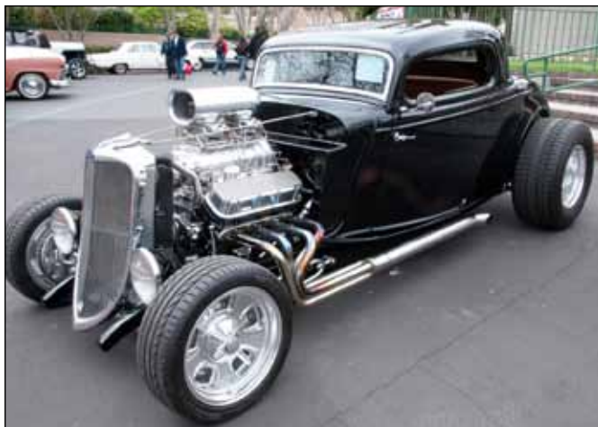
Jess Visser's stunning 1933 Ford Coupe hot rod turned a lot of heads.