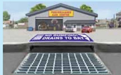
Storm Drain: an outdoor drain that flows directly to creeks and the Bay.

In general, drains inside the building are connected to the sewer system, and outside drains are connected to the storm drain system. It's important to keep car care products out of the storm drain system.