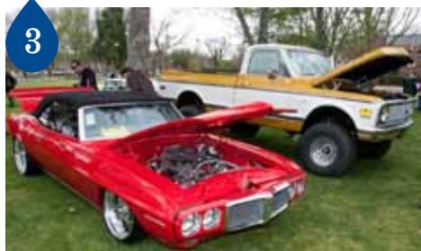
East Bay Car Culture & List of Local Events