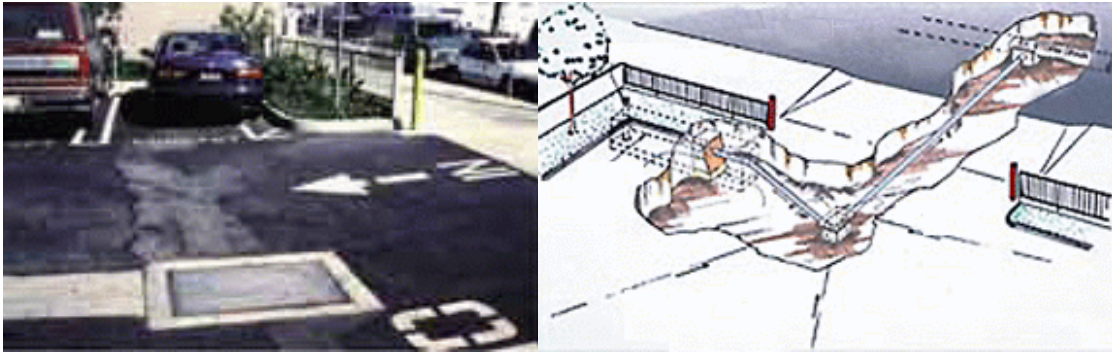
Picture and schematic drawing of parking lot infiltration

Storm water drainage well designs can be as varied as the engineers who design them. A fluid distribution system that discharges underground through piping is typically the defining characteristic. If you are unsure about the classification of your infiltration system, contact your UIC program representative for clarification.