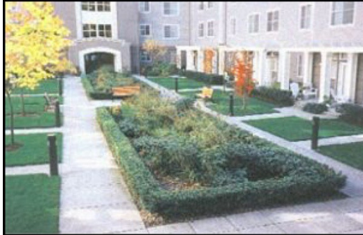
Typical Bioretention Area

The following shows sizing and calculations of the site and the treatment measures used.