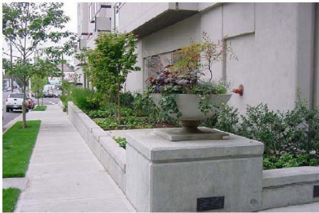
City of Portland 2004 Stormwater Manual

Parking and trash shall be under the building and covered.