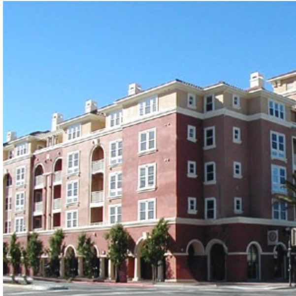
Typical Podium Building

This example is to show a proposed podium type building in Alameda County, with flow-through planters. LID feasibility/infeasibility criteria (Appendix J) need to be used to determine whether the use of flow-through planters will be allowed. Flow-through planters in this example are sized using the combination flow and volume sizing approach.