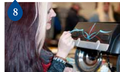
8 The Art of Pinstripping