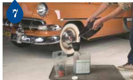
7 DIY Oil Changers: How to Dispose of Used Oil—FREE!