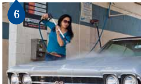
6 The Best Way to Wash Your Car